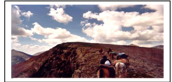
JUST AFTER PASSING POINT 12,258 ON THE SOUTHERN END OF INDIAN TRAIL RIDGE, WE BEGIN A STEEP DESCENT INTO CUMBERLAND BASIN AND BELOW IS TAYLOR LAKE